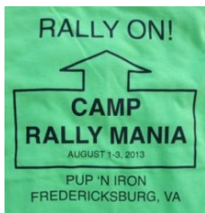
Taken from My Camp Tee-shirt

Pup 'n Iron Canine Fitness & Learning Center hosted the 2nd annual Camp Rally Mania in Fredericksburg, VA, August 1 – 3, 2013.